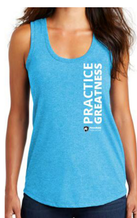
WOMEN'S TRI RACERBACK TANK POLYESTER/COTTON/RAYON ROYAL FROST XS, S, M, L, XL $12