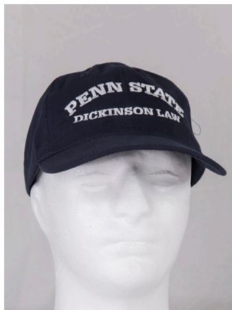
SOFT-BRUSHED CANVAS CAP NAVY $15