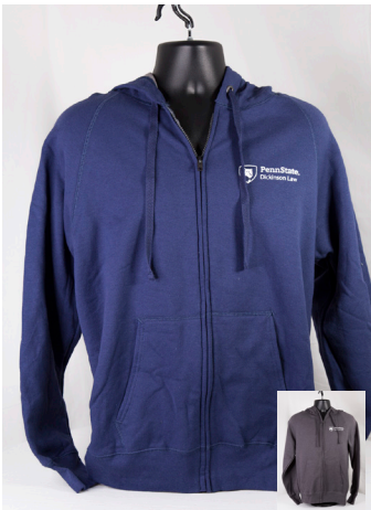
UNISEX FULL-ZIPPED FLEECE SWEATSHIRT JACKET COTTON/POLYESTER BLEND VINTAGE NAVY AND HEATHERED CHARCOAL S, M, L, XL $30