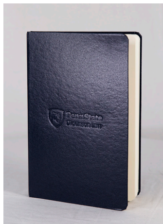
WRITING JOURNAL $10