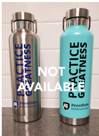
STAINLESS STEEL BOTTLE