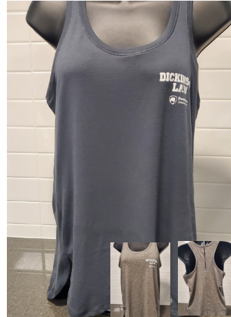
OGIA WOMEN'S LUUMA TANK CHARCOAL GREY OR HEATHER GRAY 75% POLYESTER, 20% TENCEL, 5% SPANDEX XS, S, M, L, XL $25