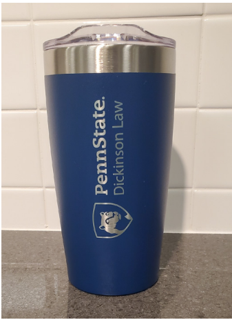
20 OZ. TUMBLER $25