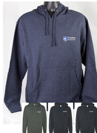
UNISEX MIDWEIGHT HOODED PULLOVER SWEATSHIRT COTTON/POLYESTER BLEND HEATHERED NAVY, NAVY OR BLACK XS, S, M, L, XL, 1XL, 2XL $32