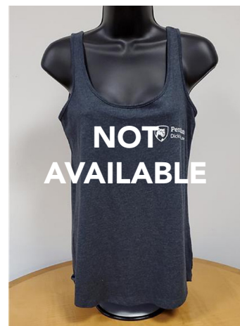
WOMEN'S JERSEY TANK