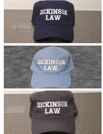
ADJUSTABLE VINTAGE HATS NAVY, SOFT BLUE, AND CHARCOAL $18