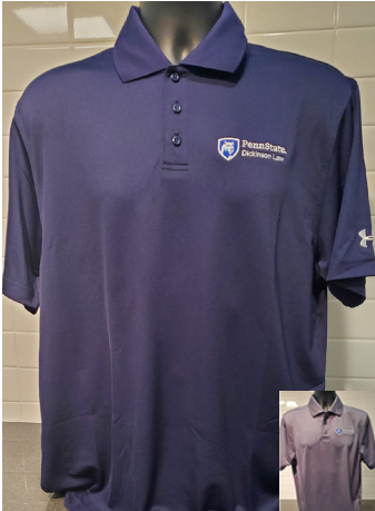
MEN'S UNDER ARMOUR PERFORMANCE POLO NAVY OR GRAPHIC STEEL S, M, L, XL $53