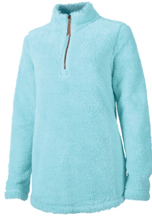
WOMEN'S PULLOVER 100% POLYESTER MINT GREEN 1-XS, 1-L, 2-2XL $55