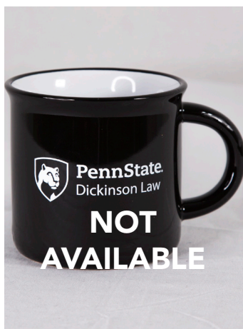
16 OZ. CERAMIC COFFEE MUG