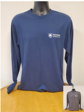
MEN'S LONG SLEEVE T-SHIRT 100% COTTON ROYAL, NAVY, BLACK AND GREY S, M, L, XL, 2XL $20