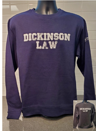
VINTAGE CREWNECK SWEATSHIRT NAVY OR GREY 80% COTTON, 20% POLYESTER SX, S, M, L, XL, 2XL $28