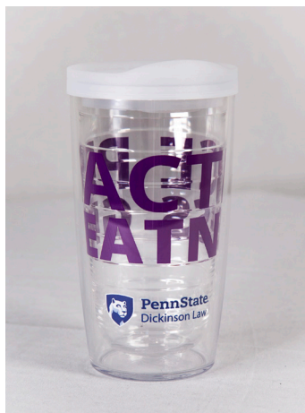
16 OZ. TERVIS TUMBLER FOR HOT AND COLD BEVERAGES $20