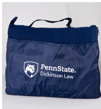
TRAVEL BLANKET ROYAL BLUE $15