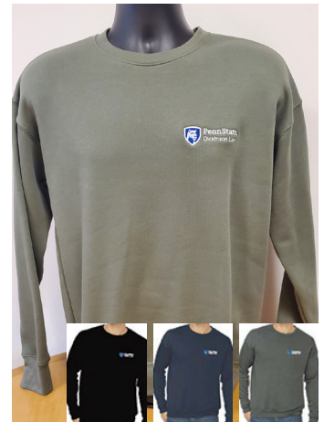
UNISEX CREW NECK SWEATSHIRT 52% COTTON, 48% POLYESTER MILITARY GREEN, BLACK, NAVY AND GREY XS, S, M, L, XL $28