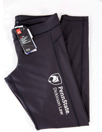
UNDER ARMOUR® HEAT GEAR COMPRESSION LEGGINGS BLACK XL ONLY $45