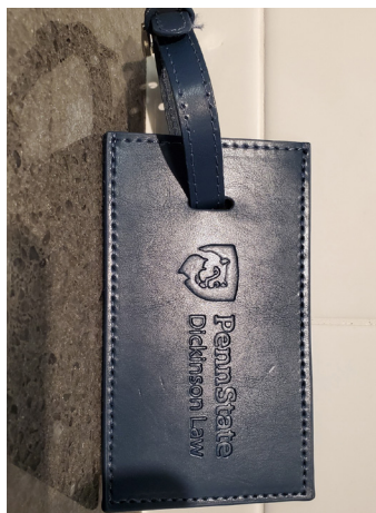
LEATHER LUGGAGE TAG $10