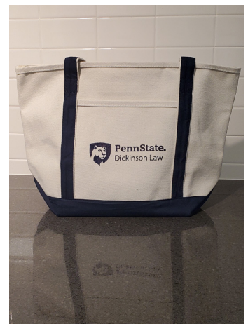
HEAVY COTTON CANVAS BOAT TOTE BAG 20 x 13 INCHES $25