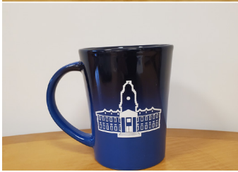
14 OZ. COFFEE MUG $10