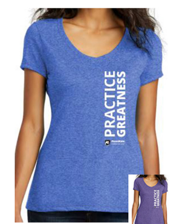
WOMEN'S V NECK TEE POLYESTER/COTTON/RAYON HEATHER BLUE, HEATHER PURPLE XS, S, M, L, XL $15