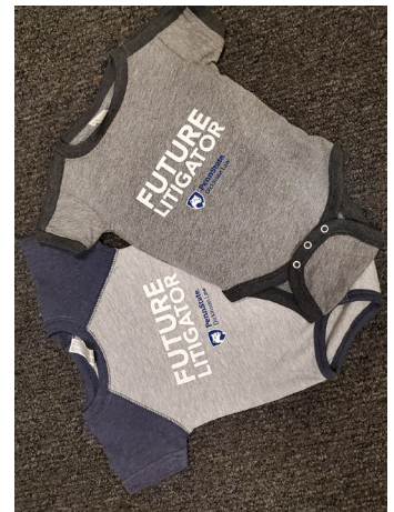
ONESIES 60% COTTON, 40% POLYESTER DARK SLEEVES, STRIPE SLEEVES 6 MO., 12 MO., 18 MO. $15