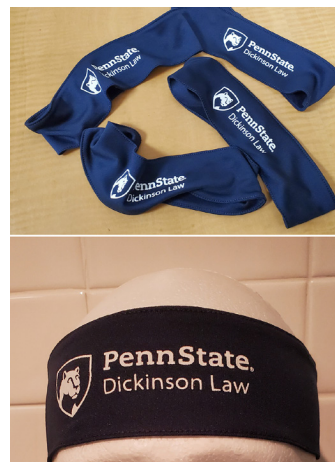
HEADBAND BLUE $8