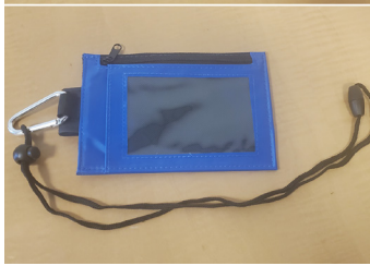
VINYL LANYARD 4 3/4" x 3" SLIP-IN POCKET WITH 3 3/4" x 2 1/4" OPENING FOR STORING DRIVER'S LICENSE/ ID CARD WITH CLIP-AWAY CARABINER AND BREAKAWAY SAFETY LANYARD, WILL HOLD IPHONE $8