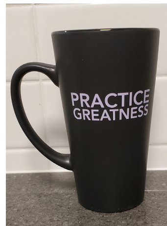
LATTE MUG $12