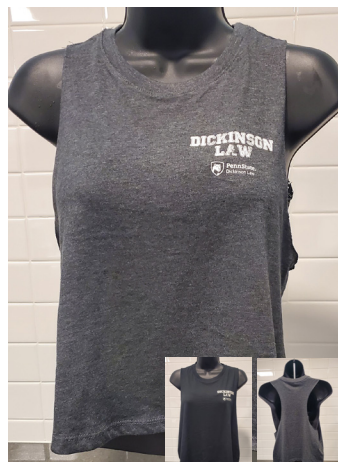
WOMEN'S RACERBACK CROPPED TANK BLACK OR HEATHER GREY 52% COTTON, 48% POLYESTER $15