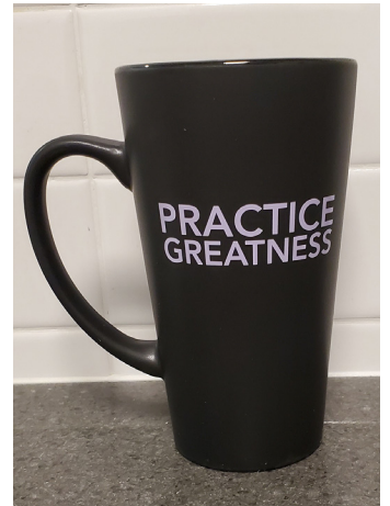
LATTE MUG $12