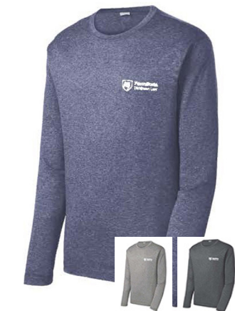
MEN'S LONG SLEEVE PERFORMANCE T-SHIRT 100% POLYESTER HEATHER BLUE, HEATHER GREY, AND HEATHER CHARCOAL S, M, L, XL, 2XL, 3XL $20