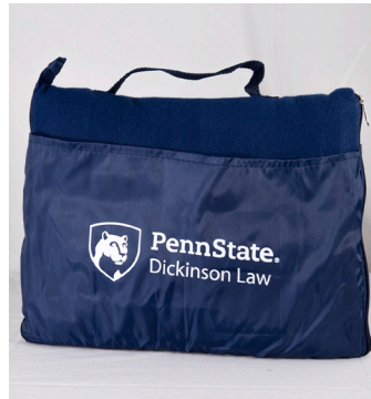
TRAVEL BLANKET ROYAL BLUE $15