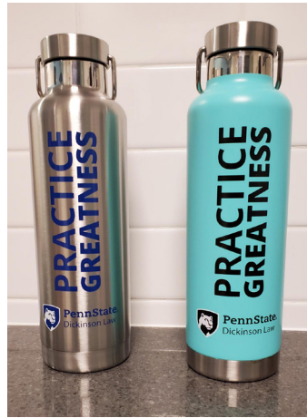
STAINLESS STEEL BOTTLE MINT GREEN OR BRUSHED CHROME $20