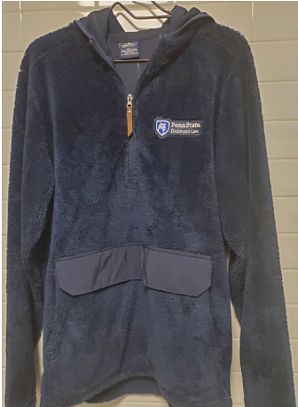
MEN'S PULLOVER 100% POLYESTER NAVY 1-L 1-M $55