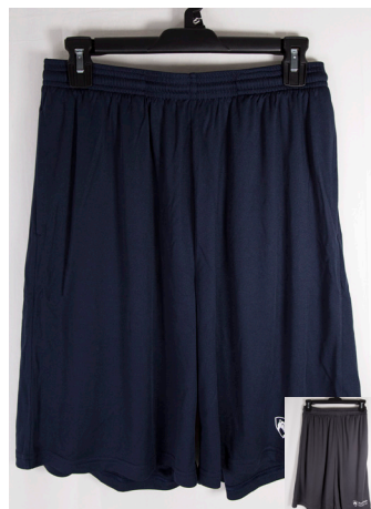
MEN'S ATHLETIC POCKET SHORTS POLYESTER TRUE NAVY AND IRON GREY S, M, L, XL $15