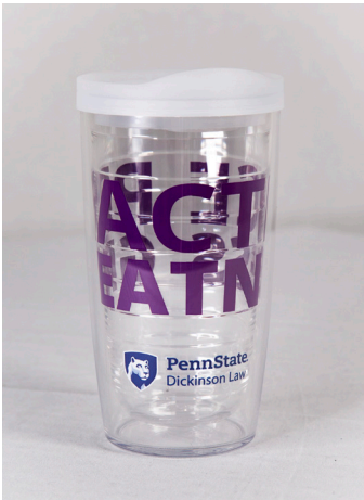
16 OZ. TERVIS TUMBLER FOR HOT AND COLD BEVERAGES $20