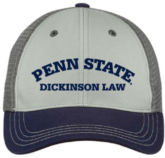
MESH-BACK CAP $15