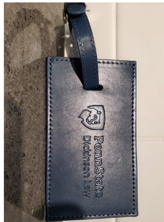
LEATHER LUGGAGE TAG $10