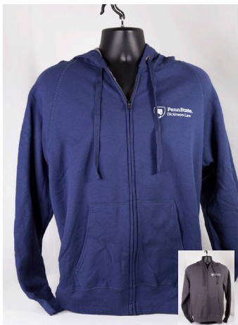
UNISEX FULL-ZIPPED FLEECE SWEATSHIRT JACKET COTTON/POLYESTER BLEND VINTAGE NAVY AND HEATHERED CHARCOAL S, M, L, XL $30