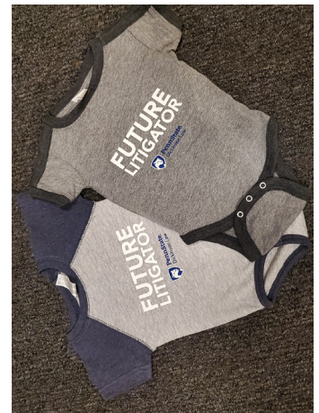
ONESIES 60% COTTON, 40% POLYESTER DARK SLEEVES, STRIPE SLEEVES 6 MO., 12 MO., 18 MO. $15