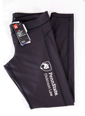
UNDER ARMOUR® HEAT GEAR COMPRESSION LEGGINGS BLACK S, M, L, XL $45