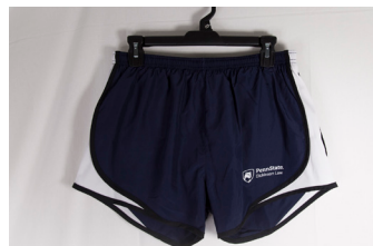
WOMEN'S ATHLETIC SHORTS POLYESTER TRUE NAVY/WHITE/BLACK AND BLACK/TRUE ROYAL/WHITE S, M, L $20