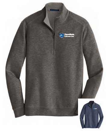
1/4 ZIP SWEATSHIRT 60% COTTON, 40% POLYESTER HEATHERED BLUE OR HEATHERED GRAY S, M, L, XL $35