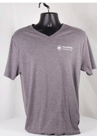
MEN'S V-NECK T-SHIRT COTTON/POLYESTER GREY FROST S, M, L, XL $15