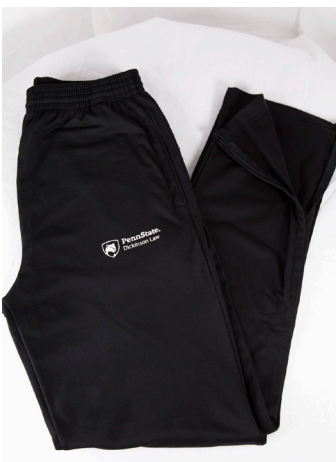
MEN'S ATHLETIC PANTS 100% POLYESTER BLACK S, M, L, XL $35