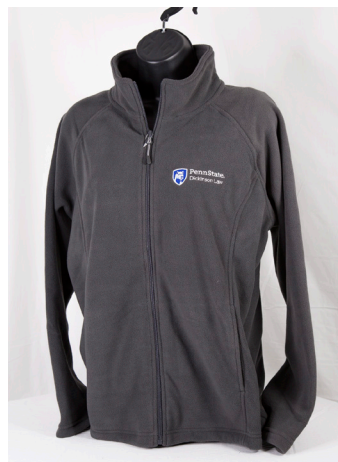
WOMEN'S FLEECE JACKET 100% POLYESTER DARK ASH SX, S, M, L, XL $35