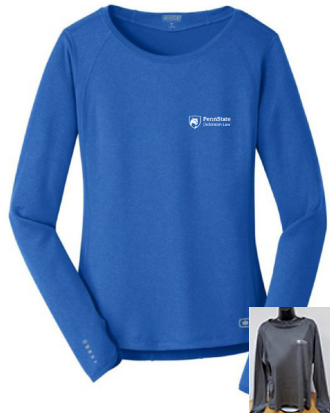
WOMEN'S LONG SLEEVE OGIO ENDURANCE PULSE CREW 100% POLY JERSEY WITH STAY COOL ELECTRIC BLUE AND GEAR GREY XS, S, M, L, XL $30