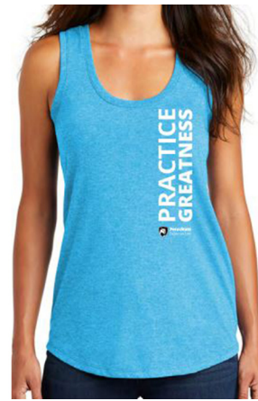
WOMEN'S TRI RACERBACK TANK POLYESTER/COTTON/RAYON ROYAL FROST XS, S, M, L, XL $12