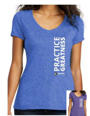
WOMEN'S V NECK TEE POLYESTER/COTTON/RAYON HEATHER BLUE AND HEATHER PURPLE XS, S, M, L, XL $15