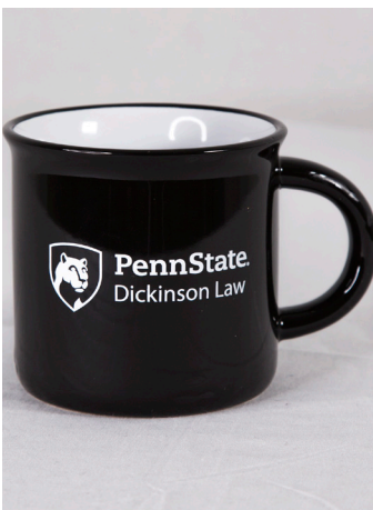
16 OZ. CERAMIC COFFEE MUG $10