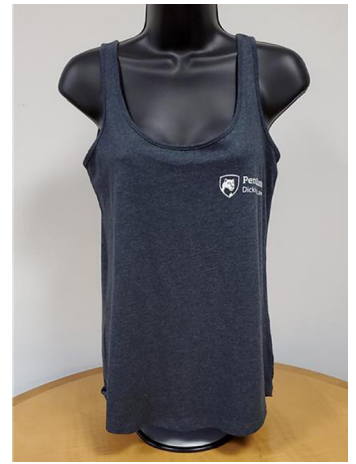
WOMEN'S JERSEY TANK 60% COTTON, 40% POLYESTER CHARCOAL XS, S, M, L, XL $12