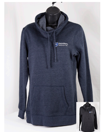
WOMEN'S LIGHTWEIGHT COWL NECK COTTON/POLYESTER BLEND HEATHERED BLUE OR HEATHERED BLACK S, M, L, XL $32