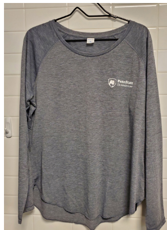
WOMEN'S POSICHARGE LONG SLEEVE TRIBLEND WICKING SCOOP NECK POLYESTER/COTTON/RAYON DARK HEATHER GREY XS, S, M, L, XL $30