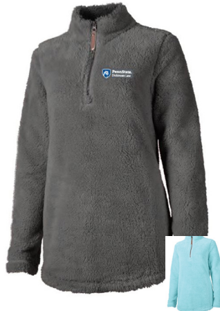
WOMEN'S PULLOVER 100% POLYESTER MINT GREEN 1-XS, 1-L, 2-2XL GREY 1-XS $55