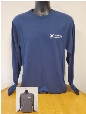
MEN'S LONG SLEEVE T-SHIRT 100% COTTON ROYAL, NAVY, BLACK AND GREY S, M, L, XL, 2XL $20