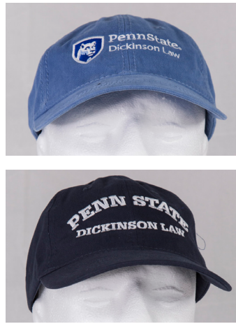
SOFT-BRUSHED CANVAS CAP LIGHT BLUE OR NAVY $15