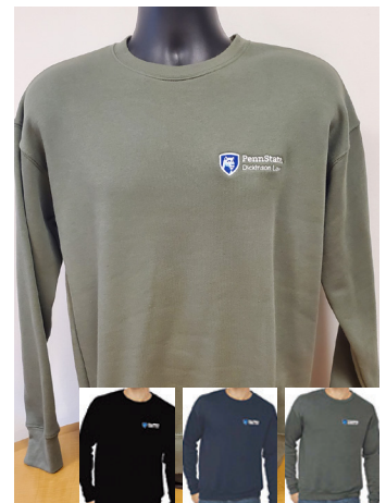
UNISEX CREW NECK SWEATSHIRT 52% COTTON, 48% POLYESTER MILITARY GREEN, BLACK, NAVY AND GREY XS, S, M, L, XL $28